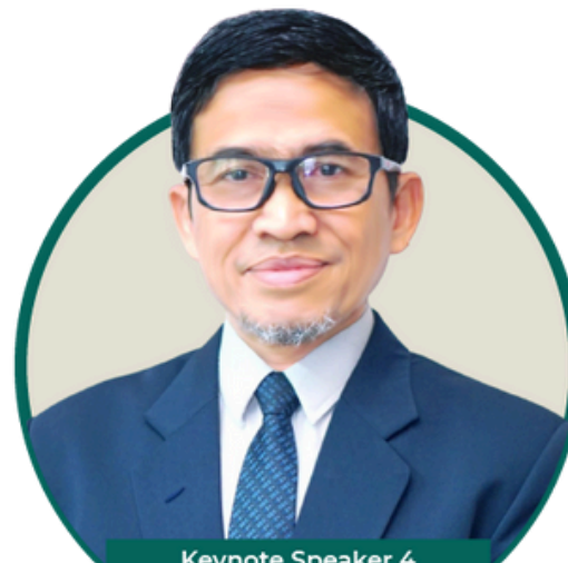
Keynote Speaker 4