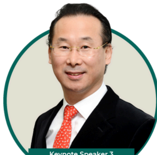
Keynote Speaker 3